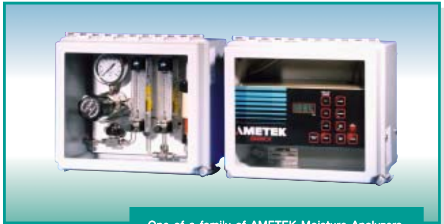
One of a family of AMETEK Moisture Analyzers

Chlorine manufacturers know the importance of measuring moisture in chlorine. Chlorine is formed by the electrolysis of brine, therefore chlorine is wet when produced and must be dried before compression and liquefaction. When dried chlorine comes in contact with water, hydrochloric acid is formed, causing corrosion to proceed rapidly in compressors and plant piping, which must be protected. The AMETEK Model 304 Moisture in Chlorine Analyzer (MCA) offers a solution to the problem of making an accurate, repeatable and reliable measurement of moisture in dried chlorine gas.