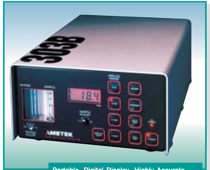
Portable, Digital Display, Highly Accurate, Proven Performance, No Calibration Needed

The portable 303B Moisture Monitor, built for NEC Division 2 areas, is designed to measure moisture content in gases