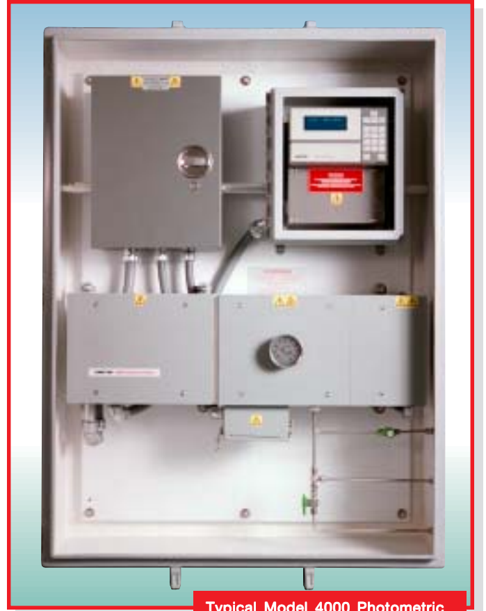
Typical Model 4000 Photometric Analyzer with a sampling system