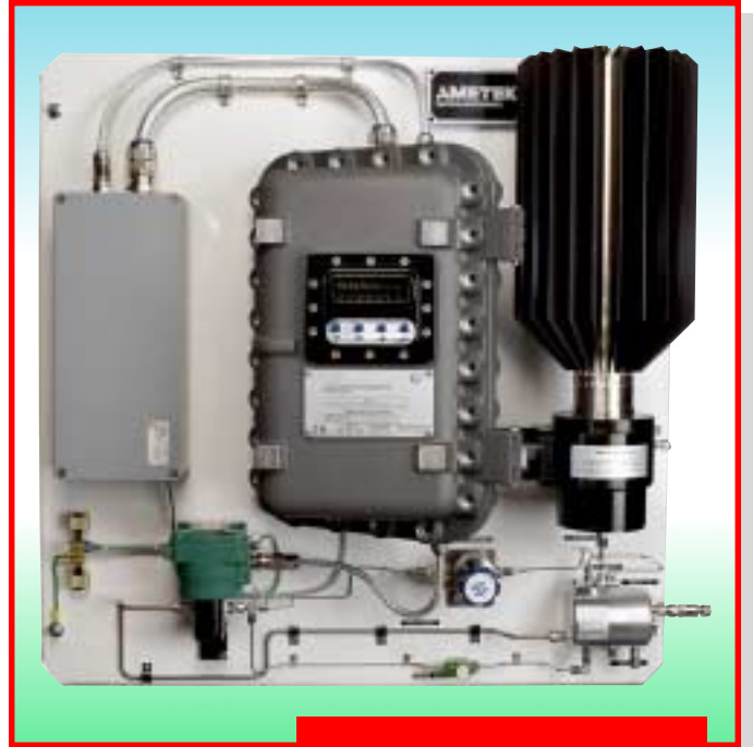
Model 241CE DewPoint Monitor

For water dew point or concentration, please refer to AMETEK's 3050-OLV quartz crystal moisture analyzer. For H 2 S analysis, please refer to our Western Research® Model 933 Analyzer.