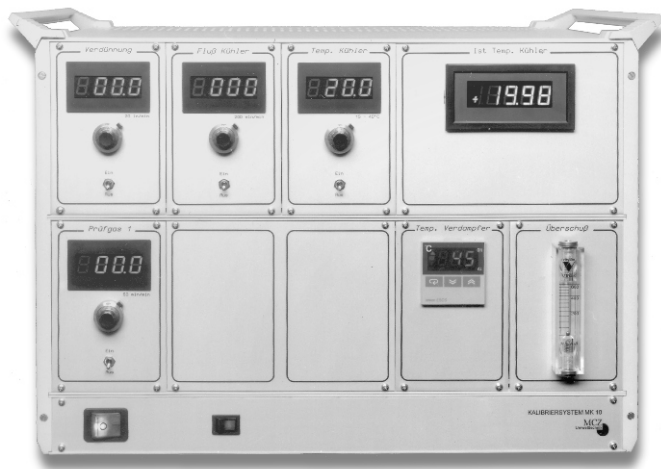
Calibrator Mk10 with options